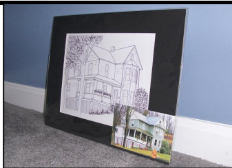
sketches of homes, churches, boats, schools print matted to fit frame size 11" x 14" (see more samples on our website)